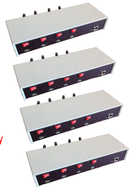
GSM Modems 4-16 ports